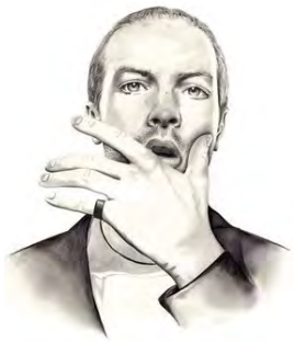
Chris Martin from 'Coldplay'